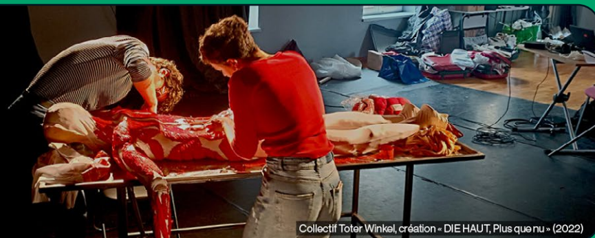
Collectif Toter Winkel, création - DIE HAUT, Plus que nu - (2022)

The Creation residencies support the development and production of artistic works by professional puppeteers with diverse aesthetics and artistic languages.